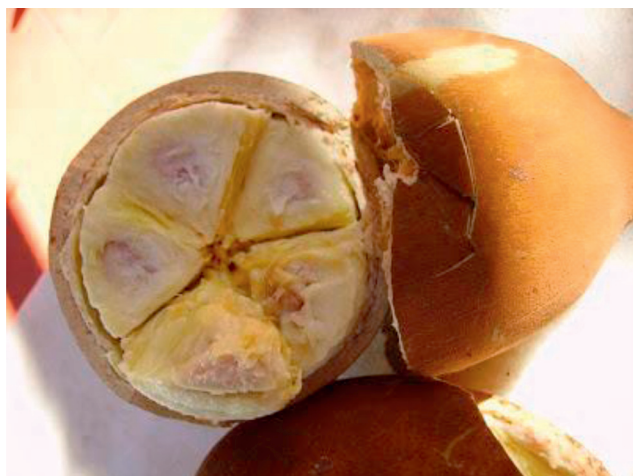
Figure 1 Cupuacu fruit and pulp.

solution to dry, sunburned or aging skin. Though it's not recognized as a sun protection factor (SPF) by the Food and Drug Administration (FDA) Monograph, cupuacu butter is well known for its ability to absorb damaging UVA/UVB rays for natural sun protection. 8,9 This is important to the skin and wound care realms in that one of the most important extrinsic factors in accelerated skin aging is solar ultraviolet radiation (UVR). Epidemiological and clinical studies have identified excessive sun exposure as a primary causal factor in various skin diseases including, premature aging, inflammatory conditions, melanoma and non-melanoma skin cancers. 10,11 A series of deleterious biochemical reactions occur within the skin when it is exposed to excess UV radiation; this process is referred to as photoaging. Chronic sun exposure damages the dermal connective tissue and alters normal skin metabolism. In addition to depressing immunity, and stimulating oxidative stress and inflammation, UV radiation increases the production of matrix metalloproteinases (MMPS), enzymes that degrade collagen. 12 The destruction of collagen is a major contributor to the loss of skin suppleness and structure that occurs with advancing age.